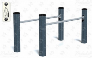
JPS20-S-M - Sport and fitness - Outdoor fitness stations / Trim trails - Metal Trim Trail (proludic.co.uk)