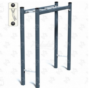
JPS22-M - Sport and fitness - Outdoor fitness stations / Trim trails - Metal Trim Trail (proludic.co.uk)

Bars are set an optimal height and width for use by widest proportion of users possible. Bars can be used in conjunction with resistance bands to aid users of all ages and abilities with rehabilitation and strengthening.