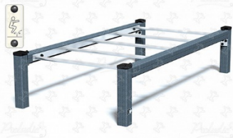
JPS21-S-M - Sport and fitness - Outdoor fitness stations / Trim trails - Metal Trim Trail (proludic.co.uk)

Bars are set an optimal height and width for use by widest proportion of users possible. Bars can be used in conjunction with resistance bands to aid users of all ages and abilities with rehabilitation and strengthening.