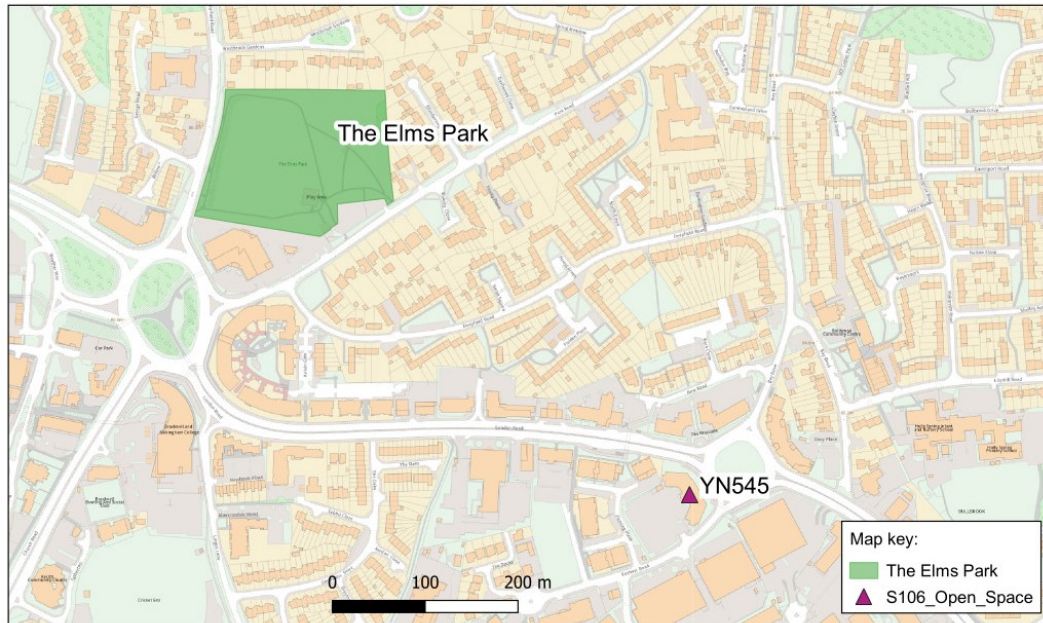
The Elms Park and nearby development 'Foundation House'