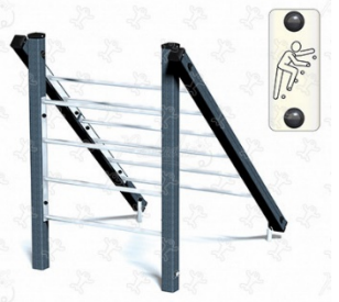
JPS16-S-M - Sport and fitness - Outdoor fitness stations / Trim trails - Metal Trim Trail (proludic.co.uk)

Climbing module challenges upper body strength item for teens and adults.